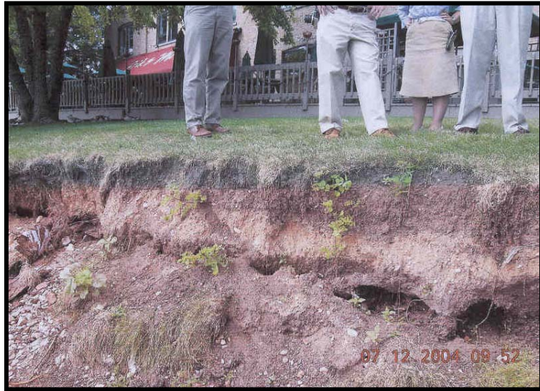
Eroded streambank on West side of River just south of Illinois Street

Once the area is stabilized, the second phase of this project is a walkway. This will allow for continuous pedestrian and bicycle access from Illinois Street to Prairie Street. This project will also assist in creating a continuous pedestrian and bicycle path from Main Street South to the Prairie Street once the proposed First Street Redevelopment project is completed.