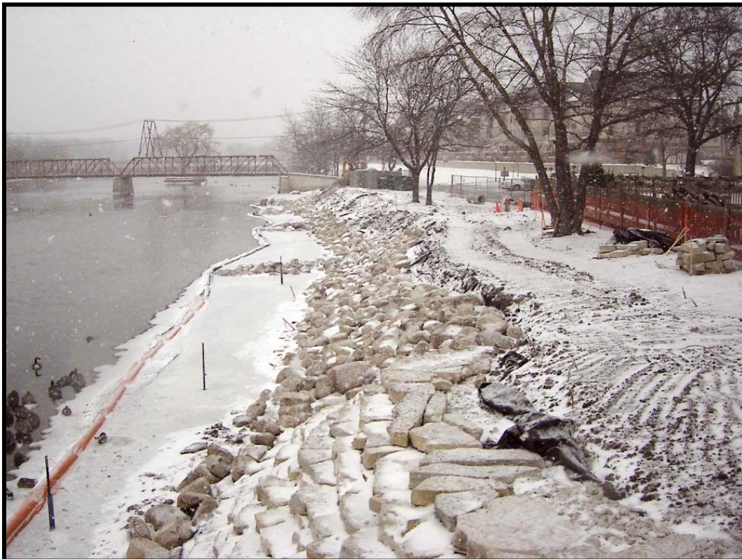
Facing south, wildlife observe a “work in progress” on a wintery day.

Once the area is stabilized, the second phase of this project is a walkway. This will allow for continuous pedestrian and bicycle access from Illinois Street to Prairie Street. This project will also assist in creating a continuous pedestrian and bicycle path from Main Street South to the Prairie Street once the proposed First Street Redevelopment project is completed.