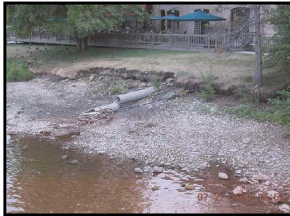
Before stabilization project

The Kane County Riverboat Grant Program is proud to have partnered with the City of St. Charles on this important environmental project that will improve the natural habitat of the Fox River and create a healthier river, better fishing and other activities like canoeing and boating. The entire community and visitors will benefit from this project as it cleans up and beautifies the Riverfront area and makes it more appealing to walk or ride along, shop downtown, or spend time with family and friends.