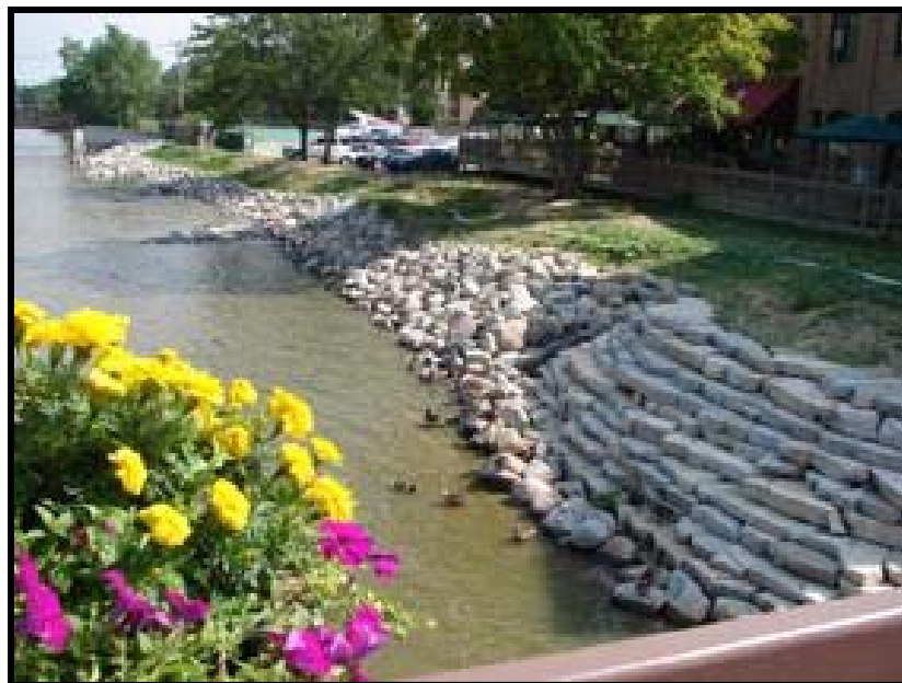
After stabilization project